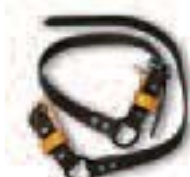
89N - 28"