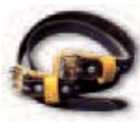
85N - 24"