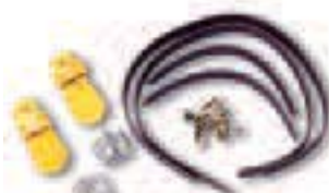
87N - 28"