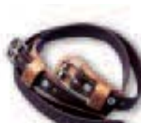
86N - 28"